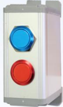
Mini-Alert Input Control Up to 4 Activation Inputs Per Mini Alert