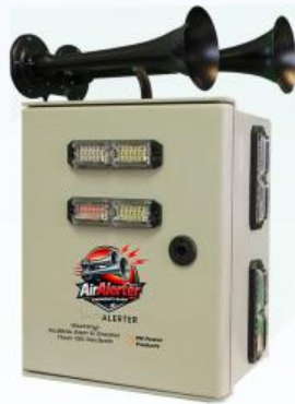
PropStop, AirAlerter and PB-1 Inputs for Alerting and Notifications