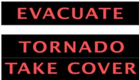
Display Wall Board Single and Dual Line Display in Multiple Colors and Languages