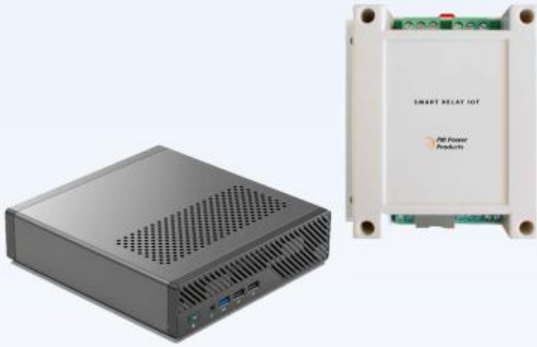
Message Control Server with System Activation Relay