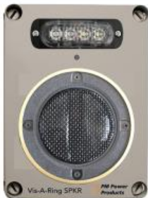
Integration with Existing Paging Using Multicast