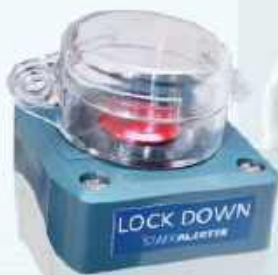
Push Button Alert