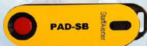
Personal Alerting Device (PAD)