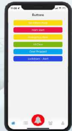
SA-Inform Cell Phone Application

Call or Email for a Free Consultation or Quote