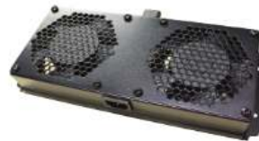
FME-FANS Dual 4" Fan Assembly 120VAC