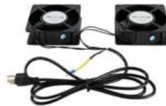
WME-FAN Dual Fan Kit for 27U/42U Cabinets